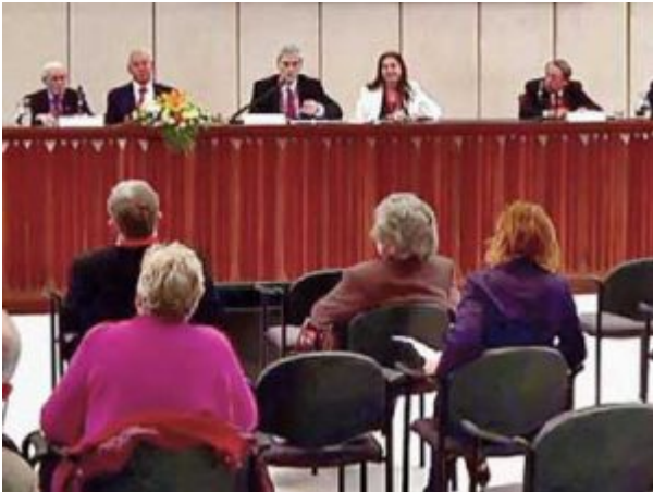
Demography and the Culture of Relationship between Couples Conference