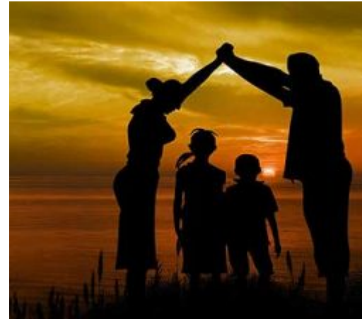
Lecture series to protect the family